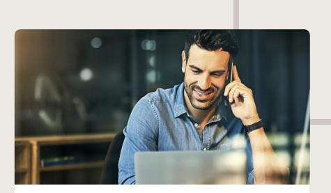
Increased accuracy and compliance resulting in less need for applicant follow-up

times reduced from days to hours in most cases